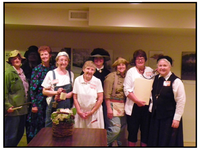
Lutheran Women's Missionary League