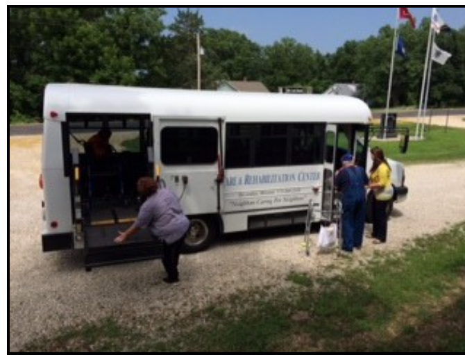
Iberia Home School Group