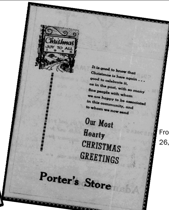
From the Iberia Sentinel, December 26, 1946