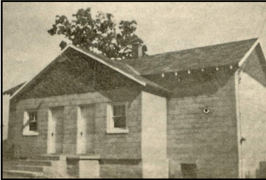
OLD AURORA SPRINGS SCHOOL

Aurora Springs School District was established on April 4, 1882. It was formed out of the old Peter Thompson District, and a small part of the Franklin District. The assessed valuation of the district when established was $26,939. Here, the Peter Thompson District, with an assessed valuation of $17,605 belonged solely to Eldon.