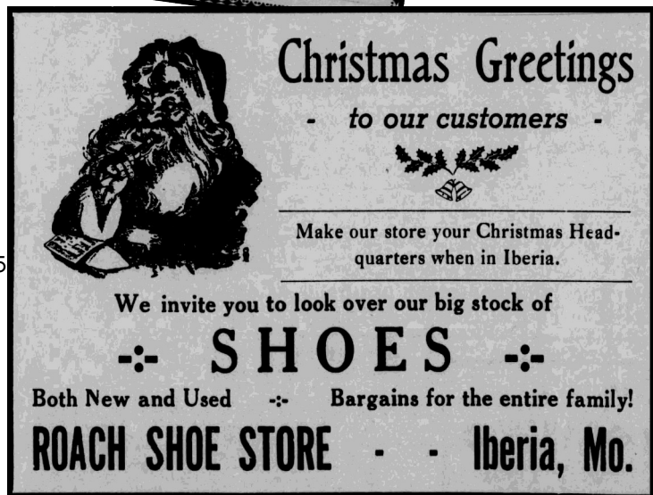
From the Iberia Sentinel, December 19, 1935